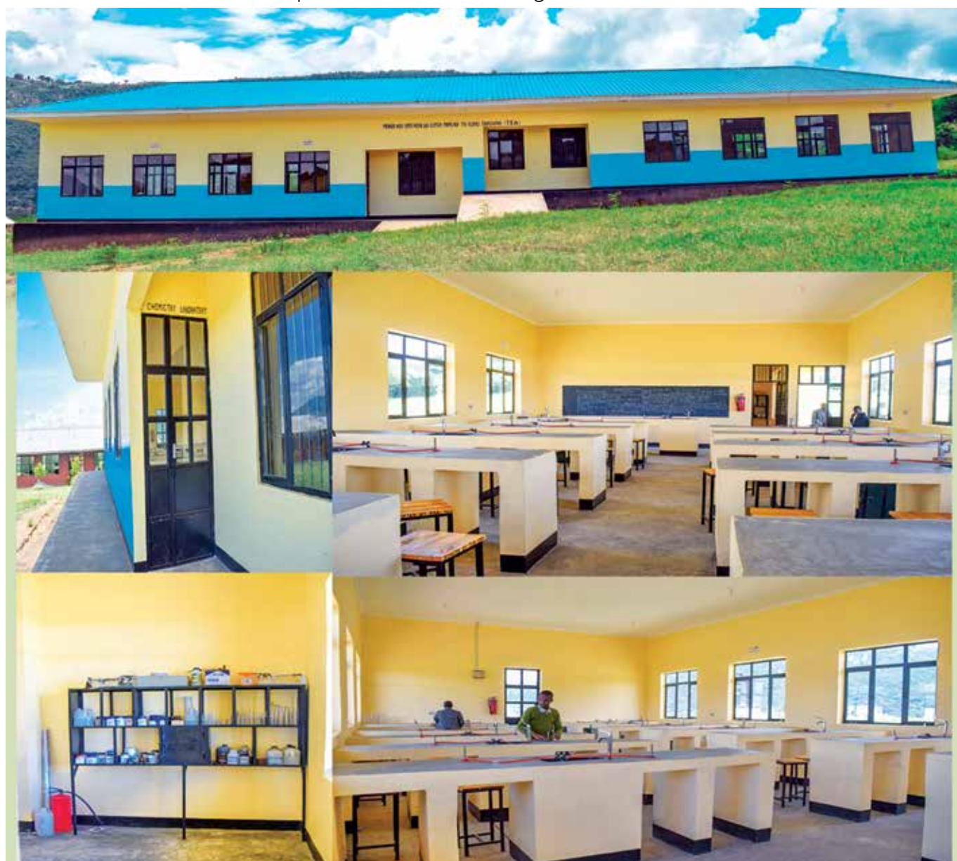
Out and inside views of Science Laboratory for Maganjwa Secondary School in Babati DC of Manyara Region Funded by the Education Fund in the FY 2021/2022.

On a legal basis, TEA was established under section 5 (1) of the Education Fund Act No.8 of 2001 to manage the Education Fund. The Fund was established under the same Act with the intention to supplement Government's efforts in financing education development in all levels of education in Tanzania Mainland, and tertiary levels of education in Tanzania Zanzibar. On the same basis, the resources mobilized by the Education Fund are used to improve Access, Equity and Quality of education in accordance with provisions of the enabling Act.