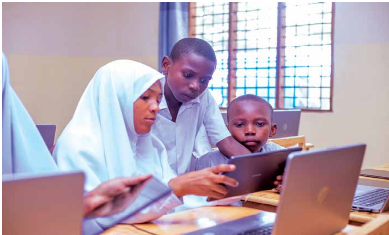
The Miburani Secondary School students exploring computer (tablets and laptops) donated by BRAC-Maendeleo Tanzania through the Education Fund.