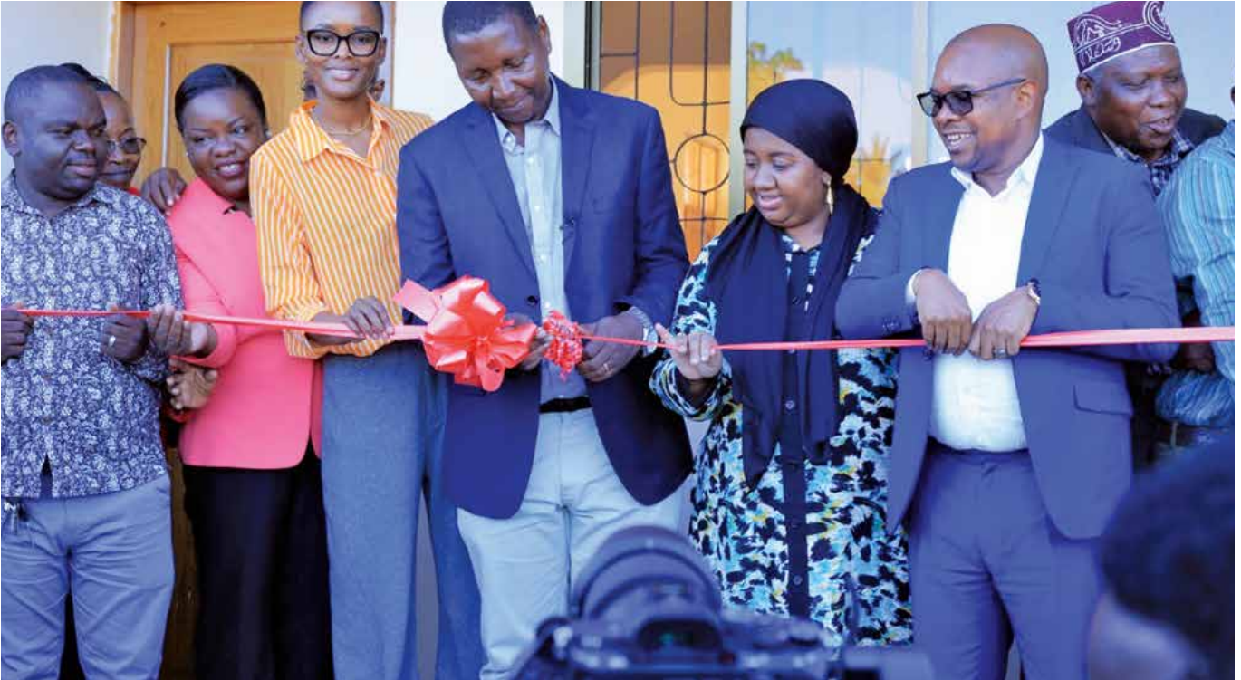
Minister of Education, Science and Technology, Prof. Adolf Mkenda (MP) (in the Middle) officiating the teachers' houses at Msinune Primary School in Chalrinze DC-Coastal Region. The Project was co implemented by TEA and the Flaviana Matata Foundation.

To ensure effectiveness and impact of the Education Fund, the Authority focuses on a number of identified priority areas of support that are geared towards achieving improved quality, increased access and equity of education at all levels. The areas of support are always in-line with the National Education Sector Development plans, including but not be limited to: