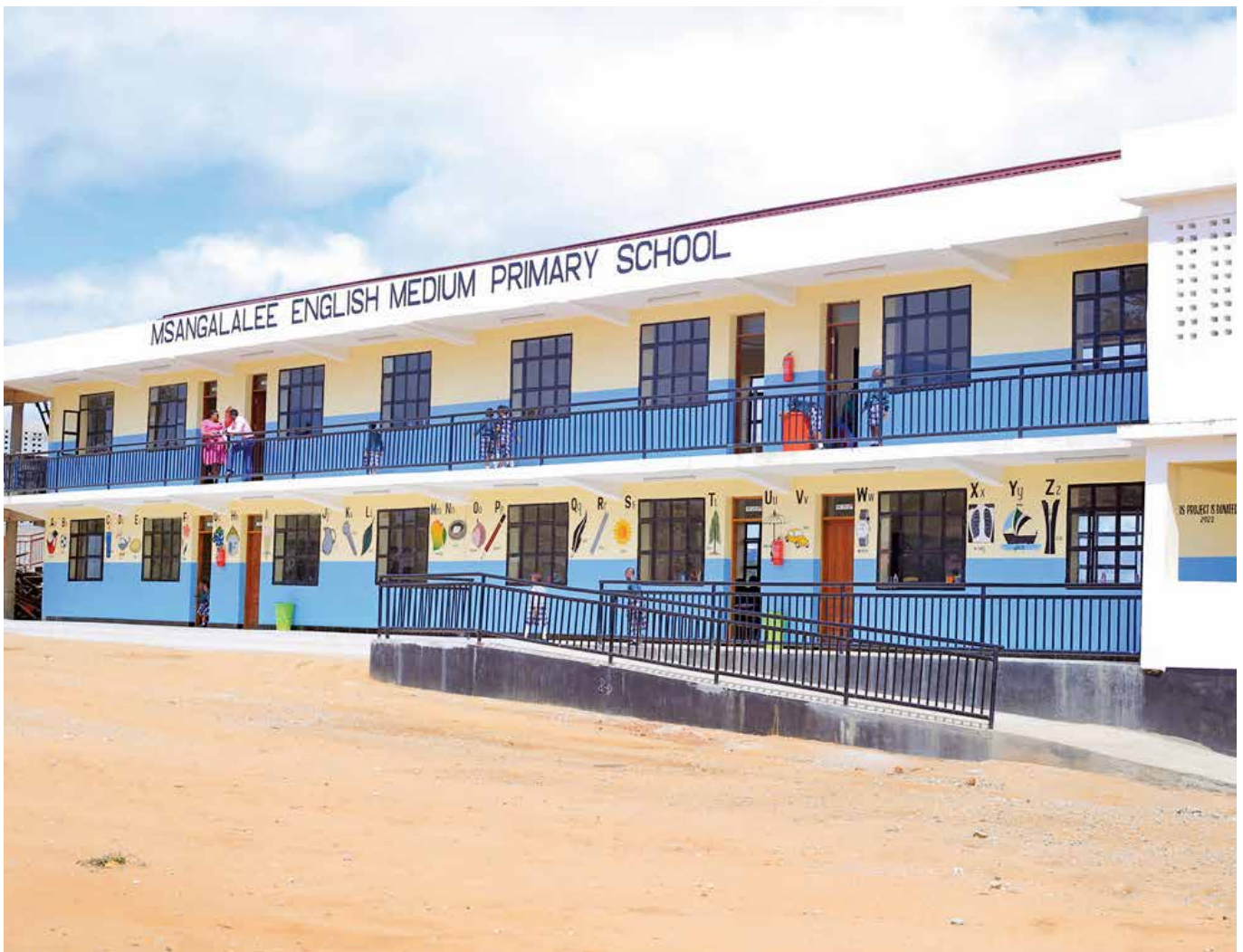
Msangalalee English Medium Primary School in Dodoma city funded by the Education Fund in the FY 2021/2022.