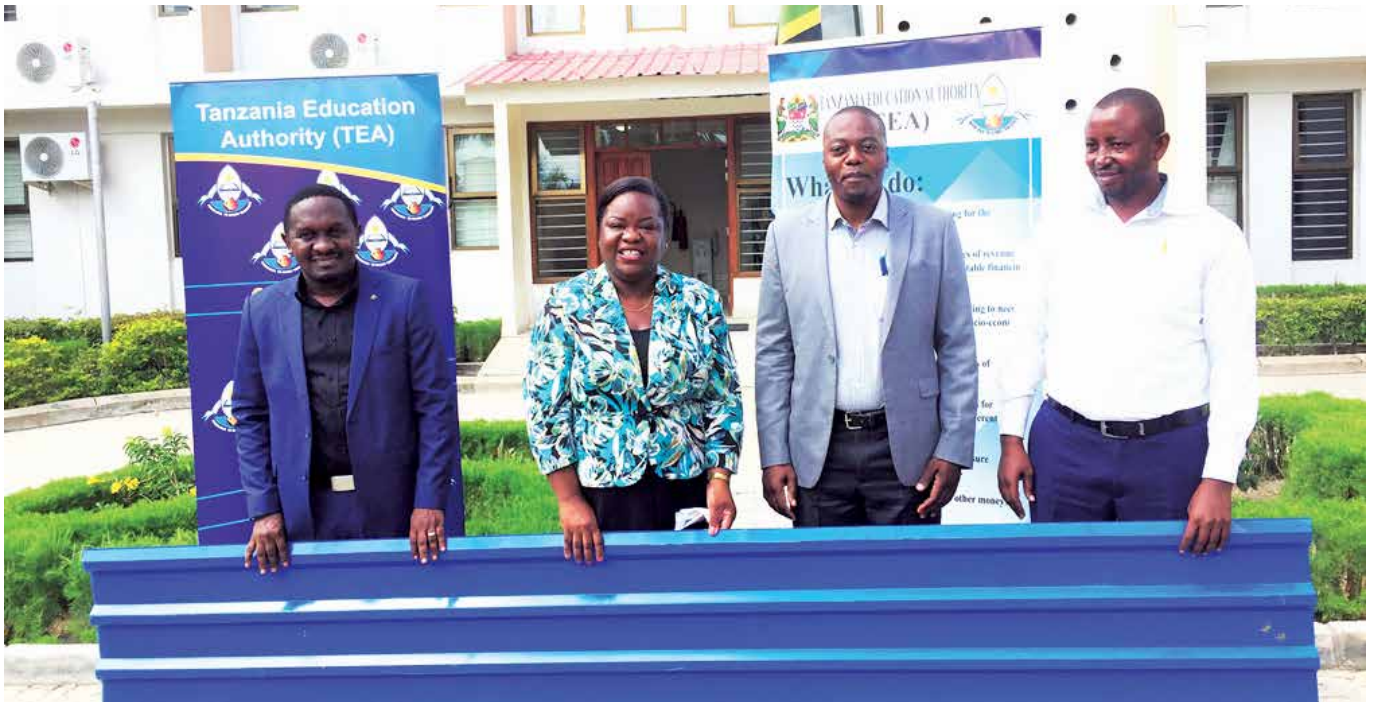
Handover ceremony of 500 Corrugated Iron Sheets to five schools of Babati DC of Manyara Region and Kigamboni Municipality of Dar es Salaam Region. The sheets worth TShs 18 million were donated Yalin Global Company Ltd of Dar es Salaam.