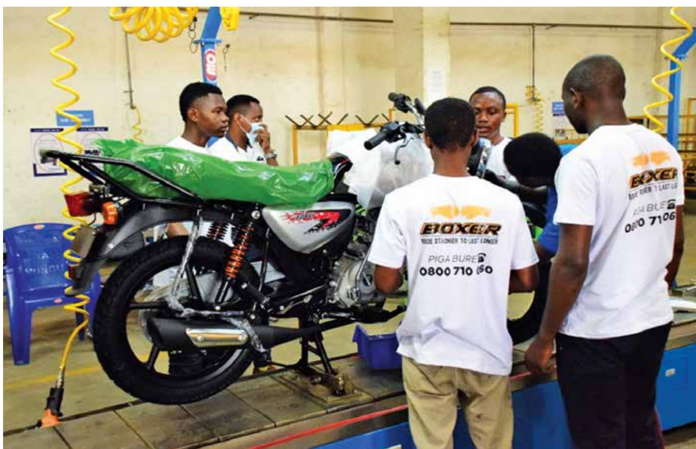
Some of the SDF beneficiaries who are employed at MeTL motorcycle assembling plant after completing SDF training on riding and maintenance of two and three legs motorbikes in Dar es Salaam by Future World VTC.